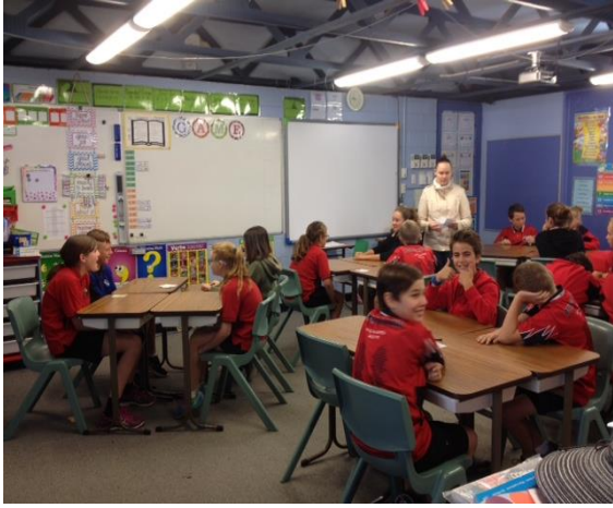
Photo shows Year 6SS back on the first day of term.